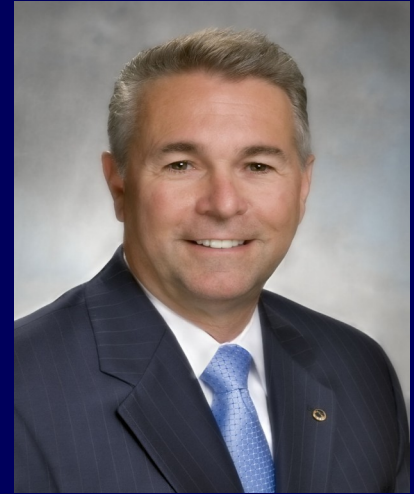
Chairman of the Board Cardinal Cushing Centers, Inc. President and CEO South Shore Savings Bank