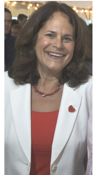
President and CEO Cardinal Cushing Centers, Inc.

I have learned many things over the past year, not the least of which is that listening is as important as taking action. Thank you for all your input and support! I look forward to a year of collective commitment, effective change, and further development of vital programming.