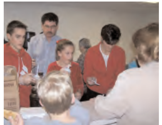
Make your own sundaes at a holiday party for students staying on campus over Christmas break. Thank you Saint Mary's Family Group!