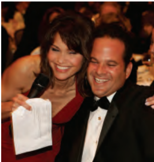
40th Annual Springtime. TJX took the lead to ensure a very successful night.