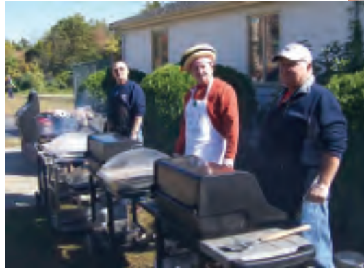
Fall festival. Thank you parents and families of our students!