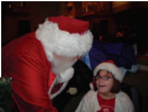
Holiday Party for all students at the Fleet Center! Thank you The Boston Bruins Foundation and the Massachusetts State Police.