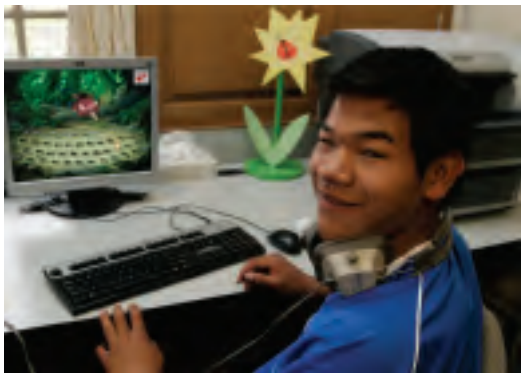
$400,000.00 in computer, telephone and technology equipment from TJX and their partners and $4,000,000,000,000,000 worth of brains to set it up. Thank you, TJX!