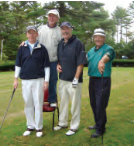
19th Annual Braintree Cooperative Bank golf tournament. 15th Annual Hill, Nevins, Powers Golf Tournament. Thank you!