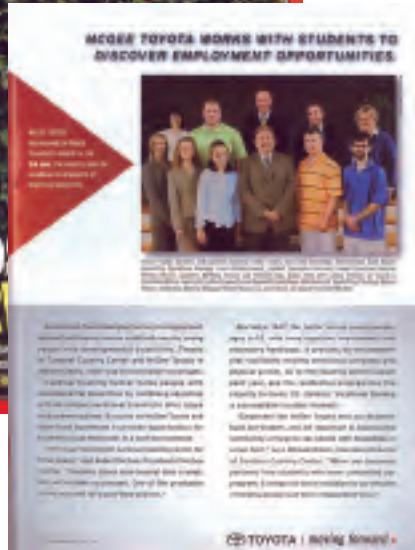
Full page ad in Time. Thank you McGee Toyota!