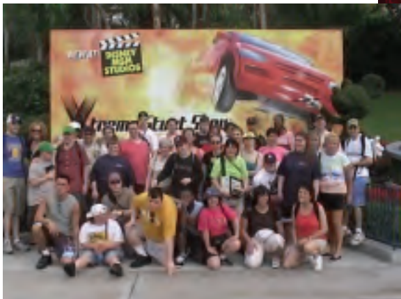
2006 Trip of a Lifetime to Disney World. Thank you Abington Savings Bank.